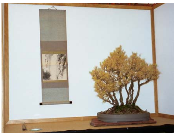
Larch forest with small fisherman to provide scale.