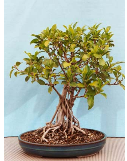
Stan Harwick's twin trunk tiger bark fig

BONSAI SOCIETY OF THE LEHIGH VALLEY P.O. Box 1684 Bethlehem, PA 18016